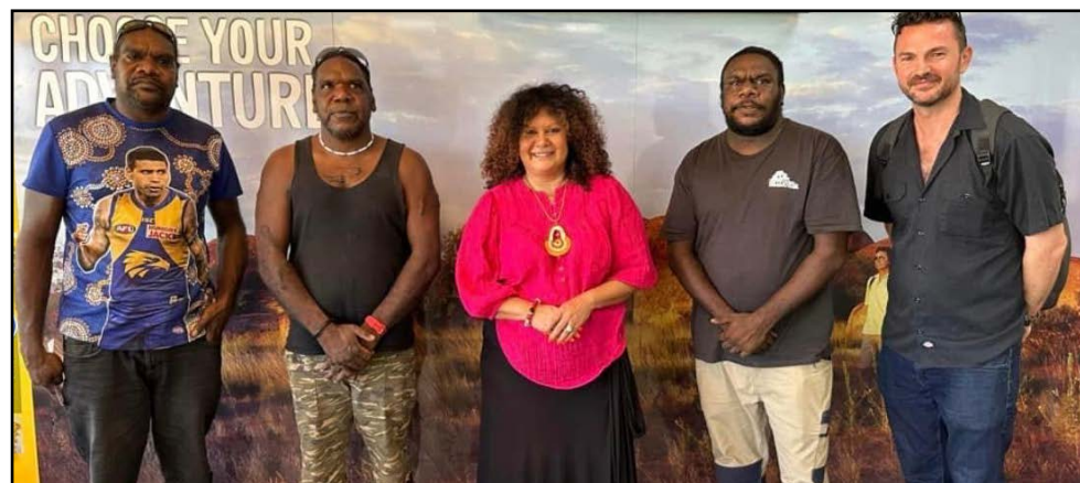
BRIGHT CAREERS: Senator Malarndirri McCarthy with the team at Barkly Arts (above) and BRADAAG (below).