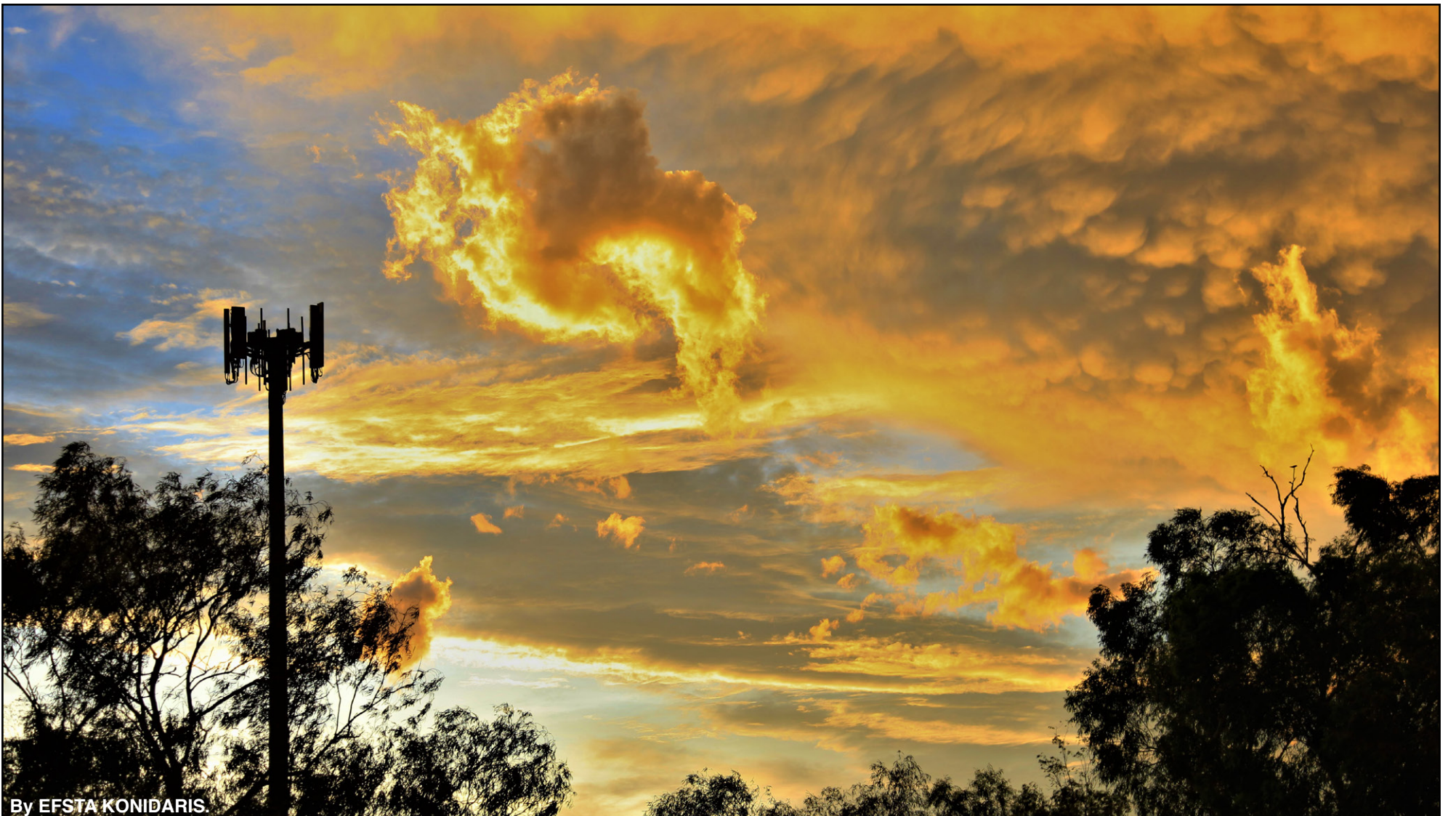
By EFSTA KONIDARIS.