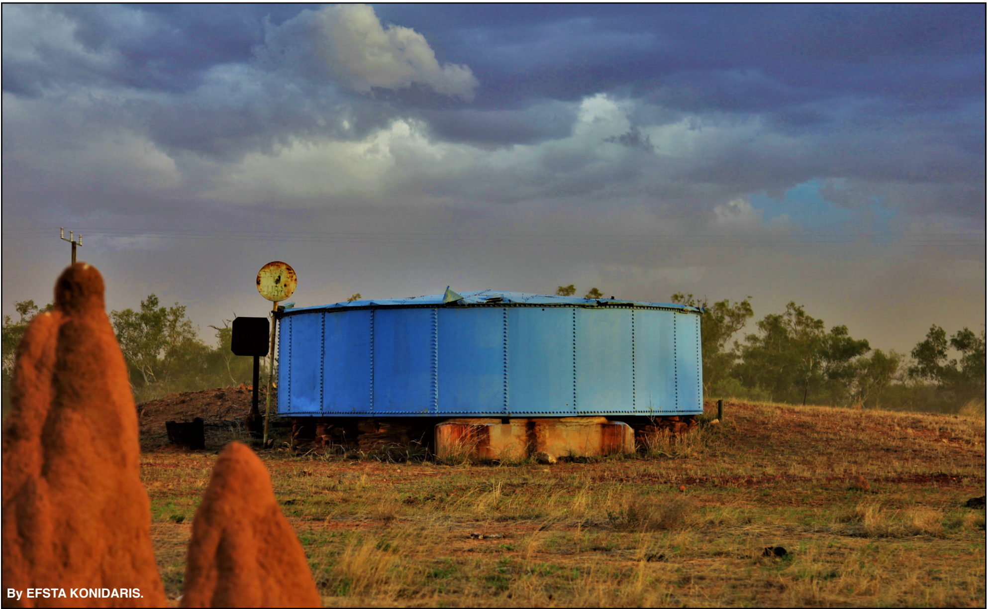
By EFSTA KONIDARIS.