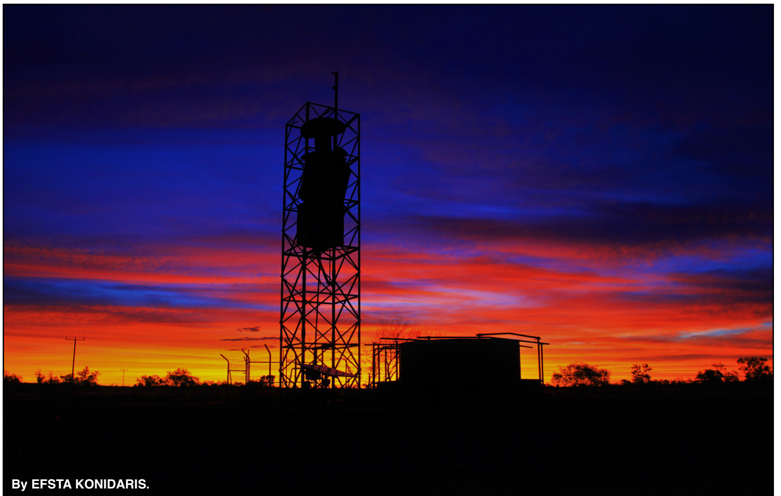
By EFSTA KONIDARIS.

To view Efsta's range of images, visit her Facebook page here .