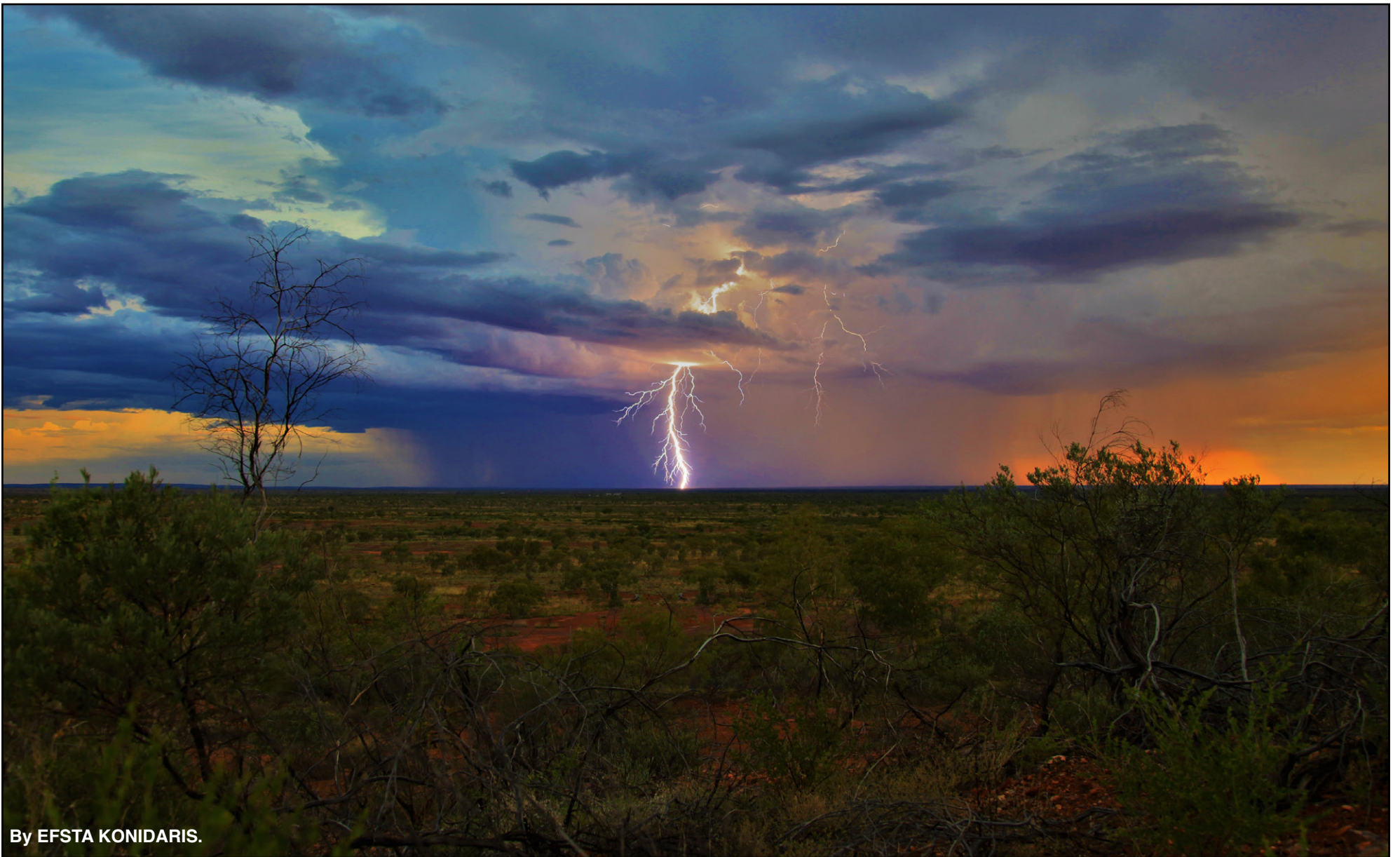
By EFSTA KONIDARIS.