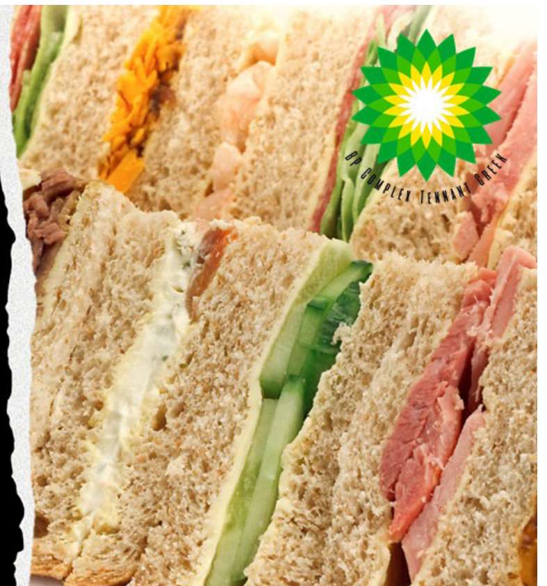
Pictured: Takeaway Sandwich

DAILY LUNCH SPECIALS AT BP COMPLEX TENNANT CREEK