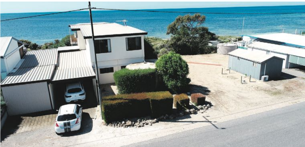
SUCCESSFUL... Elders Real Estate Yorke Peninsula has sold four coastal properties — including one each at Rogues Point and Port Vincent, and two at Sultana Point — for record prices in the past five weeks.