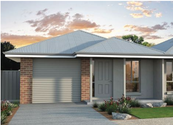
Dwellings 1 and 2 are both 2-bedroom homes, with kitchen, meals and family room, bathroom, laundry and secure garage under main roof.